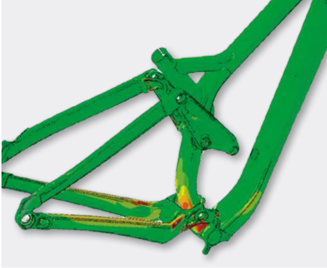
Figure 3. Abaqus/True Load model.

Strain data is extracted from the event file for when the bicycle is in a quasi-steady state and when the suspension is fully compressed. This also corresponds to the peak loading during the event. This strain data is used within True-Load/Post-Test where unit loads are scaled throughout time to minimize errors between the FEA strains and the measured strains. The resulting loads created a near perfect match between simulated strain and measured strain.