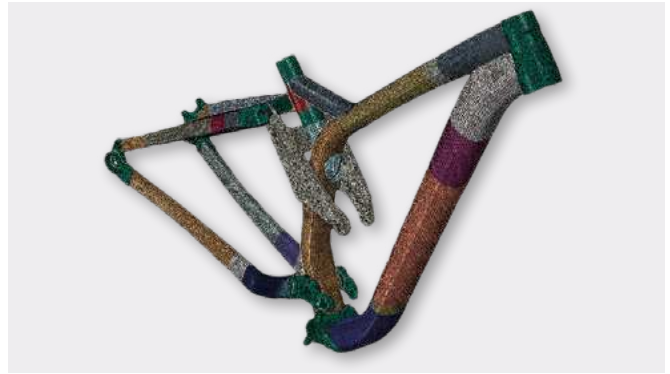
This Abaqus model of a Trek full-suspension mountain bike depicts solid and shell elements linked with constraints and connectors, a welded butted aluminum frame, and a magnesium rocker link.

The bike manufacturer took its first spin with simulation in 2009, complementing its use of the Dassault Systèmes CATIA 3D design and engineering applications with the Abaqus finite element analysis (FEA) application from SIMULIA. Trek's