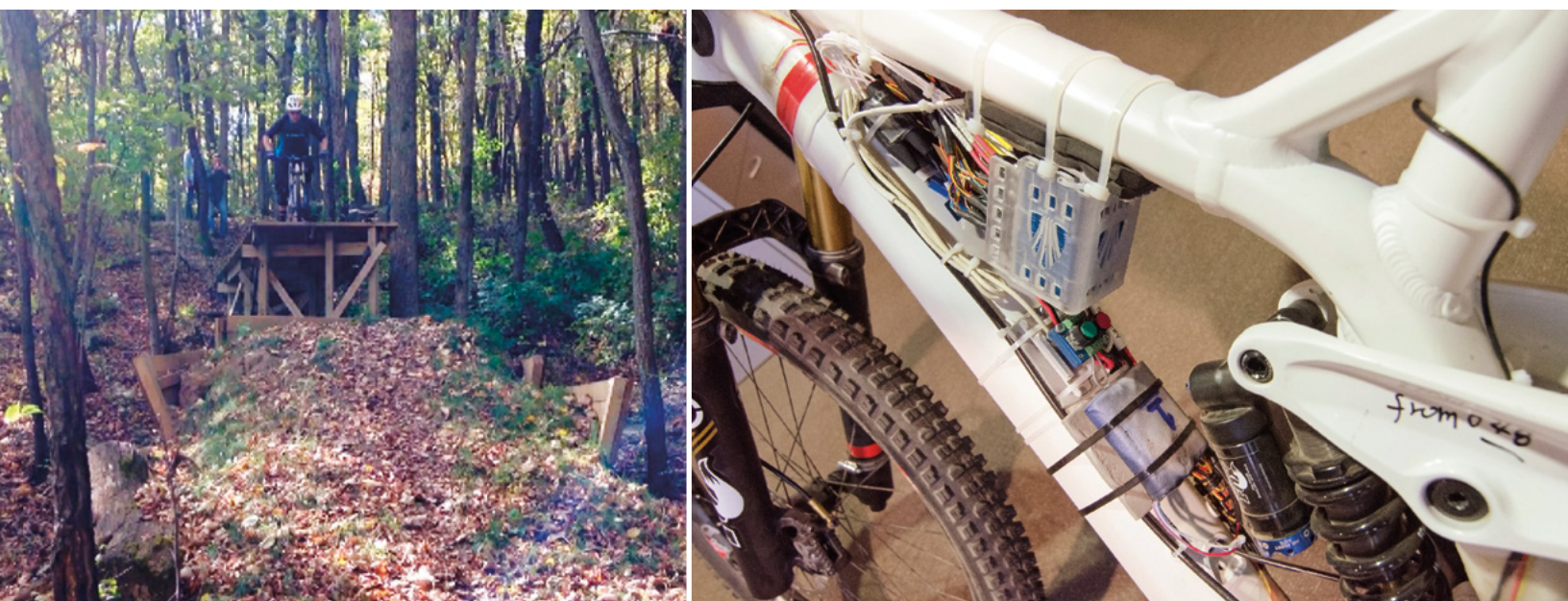
Figure 1. (Left) The Abaqus/True Load simulation used two extreme events to test drive the bike’s load cases: Deer Hunter (shown above: a bike and rider poised to drop from a raised platform down to the ground) capable of fully compressing the rear suspension, and Mojo, a jump that did the same but also allowed the rider to rotate the bike. Figure 2. (Right) Strain gauges attached onto a bike frame.

Using True-Load and Abaqus, the team set up a linear static model in which the boundary conditions and unit load cases mirrored the field-collected data from the bicycle frame (see Figure 3). The material model and mesh also reflected exact strain-gauge placement and orientation—all critical fine-tuning that wouldn’t have been possible without Abaqus and True-Load, Maas says.