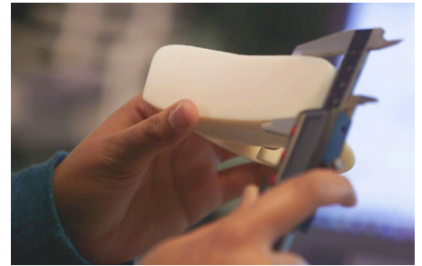
Students verify and refine their product designs with accurate, durable 3D printed prototypes.